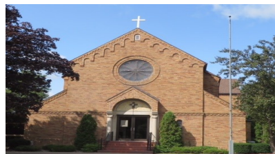
Three Churches... One Parish